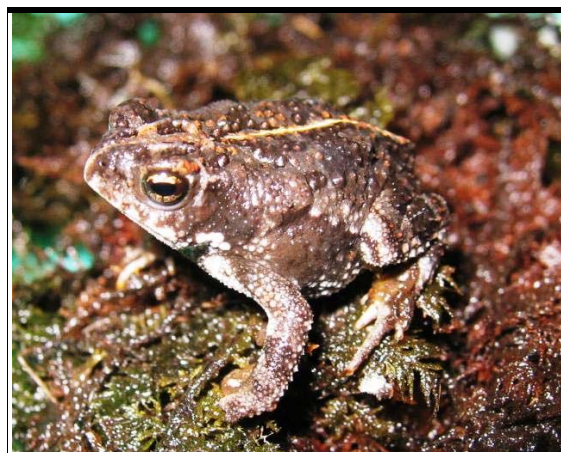
FIGURE 3. Adult Oak Toad ( Bufo quercicus ) from Grand Bay National Estuarine Research Reserve in southeastern Jackson County, Mississippi, USA.

Our review of pre- and post-burn habitat variables in