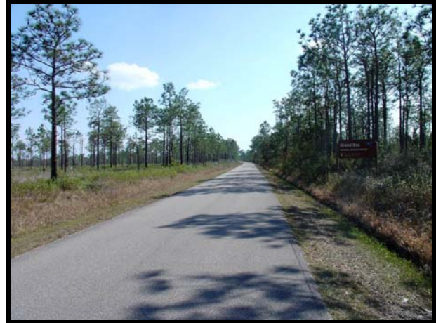
FIGURE 1. Entrance to the Grand Bay National Estuarine Research Reserve, Mississippi, USA with burned habitat on the left and unburned habitat on right.

A mosaic of pine flatwoods and southern wiregrass savannas dominates the inland regions of the GBR. Open canopies of Slash Pine ( Pinus elliotii ) are interspersed with open moist savannas dominated by herbaceous cover reaching 100% in most areas. Herbaceous openings are dense and dominated by Beyrich Threeawn ( Aristida beyrichiana ). Representative tree species present at our research sites were Slash Pine, Longleaf Pine ( Pinus palustris ), Red Bay ( Persea borbonia ), and Pond Cypress ( Taxodium distictum var. imbricarium ). Commonly encountered understory species consisted of Beyrich Threeawn, Wax Myrtle ( Myrica cerifera ), Inkberry ( Ilex glabra ), Buckwheat Tree ( Cliftonia monophylla ), Titi ( Cyrilla racemiflora ), Greenbrier ( Smilax spp.), Broomsedge Bluestem ( Andropogon virginicus ), Featherbristle Beaksedge ( Rhynchospora oligantha ), Panic Grass ( Panicum spp.), Sabatia ( Sabatia spp.), Sundews ( Drosera spp.), and Pitcher Plants ( Sarracenia spp.). As a result of past fire exclusion, the understory was noticeably